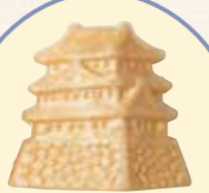
Traditional Japanese confectionery Too beautiful to eat bean-jam-filled wafers "Monaka"