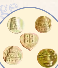
Wasanbon (refined sugar) candies Kagawa Prefecture's specialty sweets