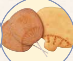
Uchiwa confectionery Eatable Uchiwa fans