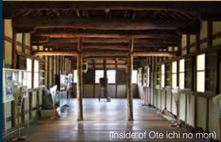
(Inside of Ote ichi no mon)